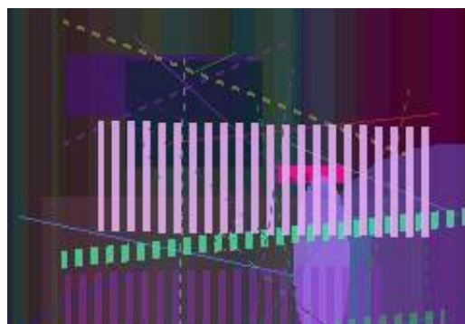
Frumoasele Straine Mircea Cartarescu Pdf Download

Laboratory- II Applied Biopharmaceutics and Pharmacokinetics Lab. 0 0 4. 2. Audit. Audit Course- ... Bio-Pharmaceutics and Pharmacokinetics by V. Venkateswarlu. 2. ... 7. www.pratham.org/images/resource%20working%20paper%202.pdf .. by Y Duan · 2020 · Cited by 16 — After understanding the biopharmaceutics and pharmacokinetics, the administration route, absorptive surface area, and transportation of drugs in the body are ... Tamasha Full Movie In Hindi Torrent Download